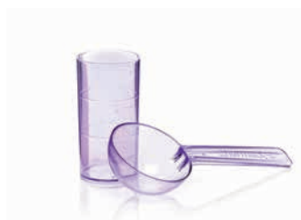
Measuring spoons set for 5-day alginates