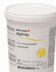
Algitray 1 kg