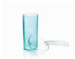
Measuring spoons set for 48-hour alginates