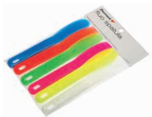
Fluorescent alginate spatulas (6 pcs)