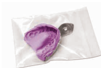
Long Life Bag, 1 pack contains 100 pcs (impression storage bags with airtight seal)